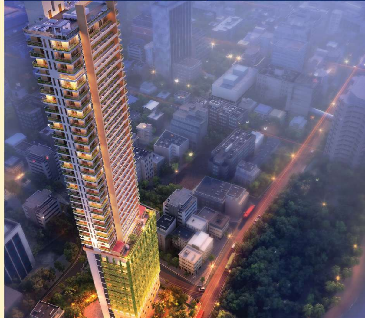
SHRISTI SEA VIEW, MUMBAI