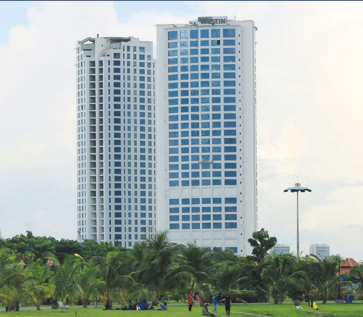
THE WESTIN & THE V, KOLKATA