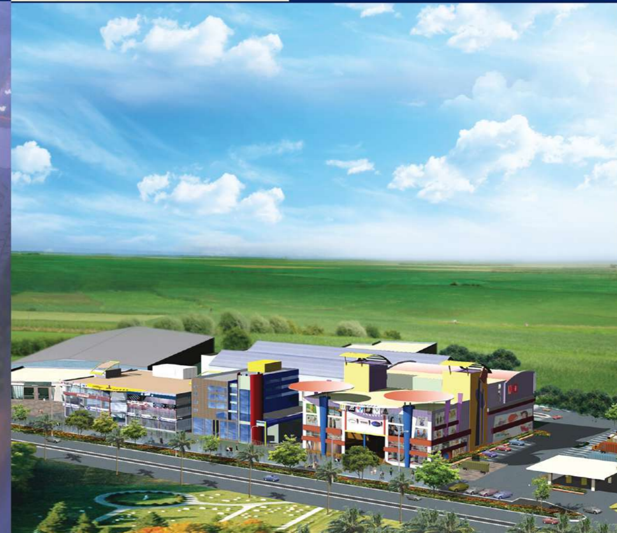
RANIGANJ SQUARE - THE HIGHWAY HUB