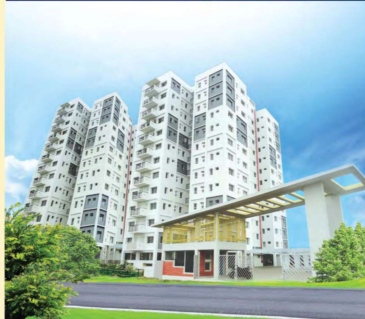
THE ARENA, HALDIA