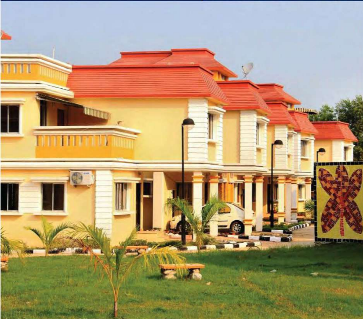
SHANTI SHRISTI, SANTINIKETAN