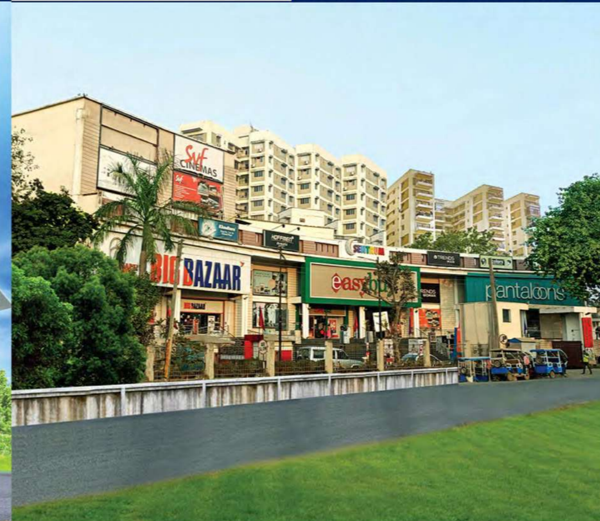
KRISHNAGAR SENTRUM, KRISHNAGAR